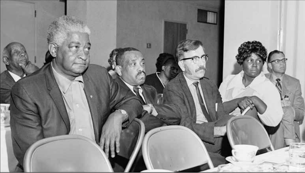
Albina District residents participated in the Model Cities Citizens Planning Board to help guide neighborhood improvements. Here, they meet in 1970 to discuss the expansion of Emanuel Hospital's campus. Between 1960 and 1980, roughly 1600 housing units were lost in lower Albina, mainly in the Lloyd District and Eliot neighborhoods, as a result of multiple urban renewal and freeway construction projects.