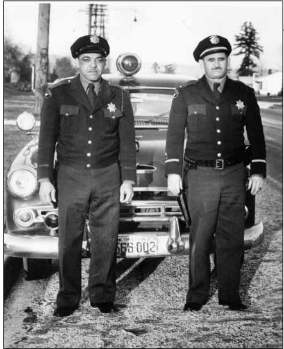
OHS digital no. 25465