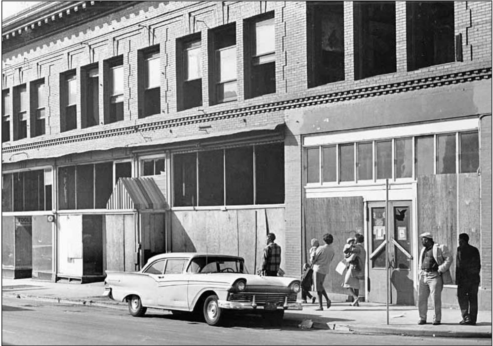
Boarded-up storefronts in the Albina neighborhood, shown here in this 1968 photograph, are signs of disinvestment in Portland's African American community.

the black man corralled up here, in its place. The badge, the gun and the holster, and the swinging club make vivid what will happen should his rebellion become overt. . . . He moves through Harlem, therefore, like an occupying soldier in a bitterly hostile country; which is precisely what, and where he is, and is the reason he walks in twos and threes. 105