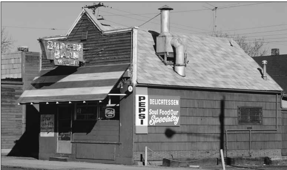
In 1981, policemen placed dead opossums on the doorstep of the Burger Barn, a black-owned restaurant on Union Avenue.