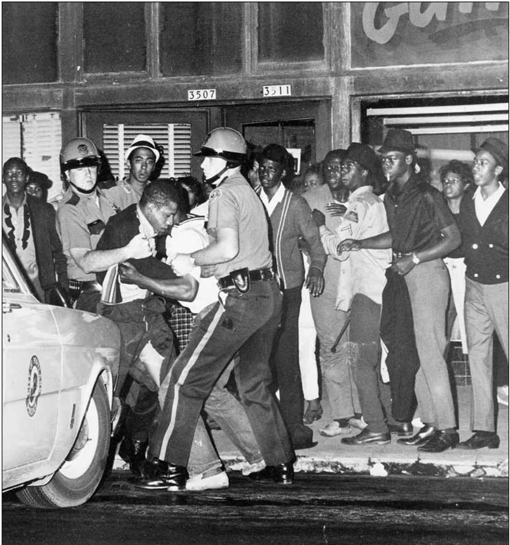
Portland police clash with young Albina residents on Union Avenue in 1969. By 1960, four-fifths of the city's black population lived in the Albina neighborhood — a result of racial segregation and isolation — while the vast majority of officers who policed the neighborhood were white.

“fundamental sense” it would be wrong to characterize the problem “solely as hostility to police.” Police officers, it explained, represented not just law enforcement but also “much deeper problems” within the larger society: “The policeman in the ghetto is a symbol, finally, of a society from which many ghetto Negroes are increasingly alienated.” 3